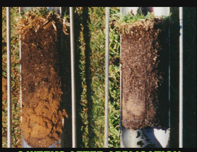
6 WEEKS AFTER APPLICATION

Soil-Zyme™ enhancement of aerobic bacteria also provides the bacteria with a more efficient digestive tool than their own. This enables the aerobic bacteria to consume and decompose organic matter at a much higher rate, which before only fungi could consume slowly. The massive increase in numbers of the enhanced aerobic bacteria sets up a feeding frenzy in which the bacteria look for any suitable food. The aerobic bacteria attack anaerobic bacteria, hydrocarbons, chemical residues (all contributing causes of black-layer), fungi spores (cause of diseases and hydrophobic soil) and plant lignin contained in thatch. The soil is being composted. As the process cleans the soil it also unlocks many other nutrients in the soil that would otherwise be unavailable to the plants. Soil-Zyme™ also de-compacts soil and encourages deeper & more efficient root systems reducing the plant's dependency on irrigation and fertiliser.