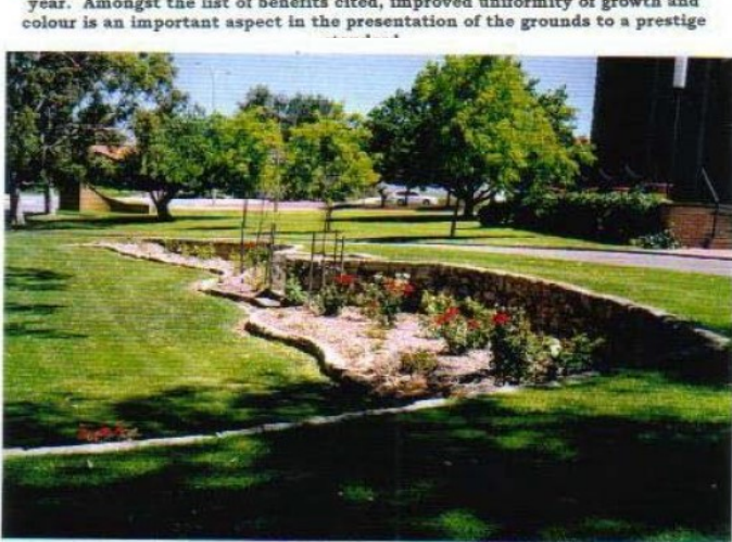
All turf and garden areas at Hale School are managed with Soil Zyme making up part of the grounds management program. The inclusion of Soil Zyme is attributed to the good colour of both turf areas and of garden beds.