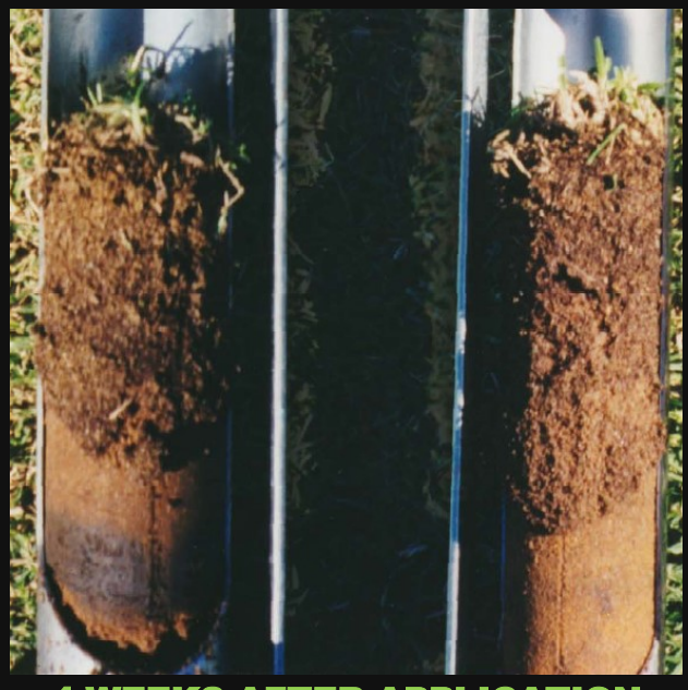
4 WEEKS AFTER APPLICATION