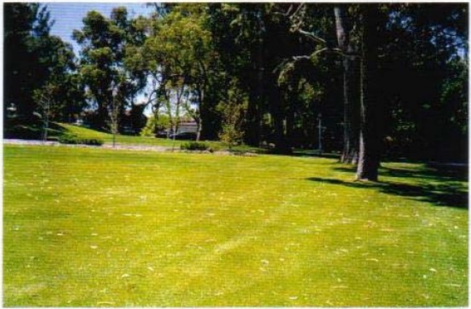
All turf areas at Hale School are treated with two applications of Soil Zyme each year. Amongst the list of benefits cited, improved uniformity of growth and colour is an important aspect in the presentation of the grounds to a prestige