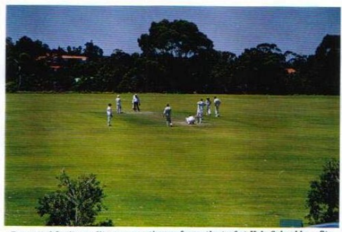
Renowned for its quality as a sporting surfaces, the turf at Hale School benefits from easier wetting and more vigorous growth attributed to Soil Zyme.