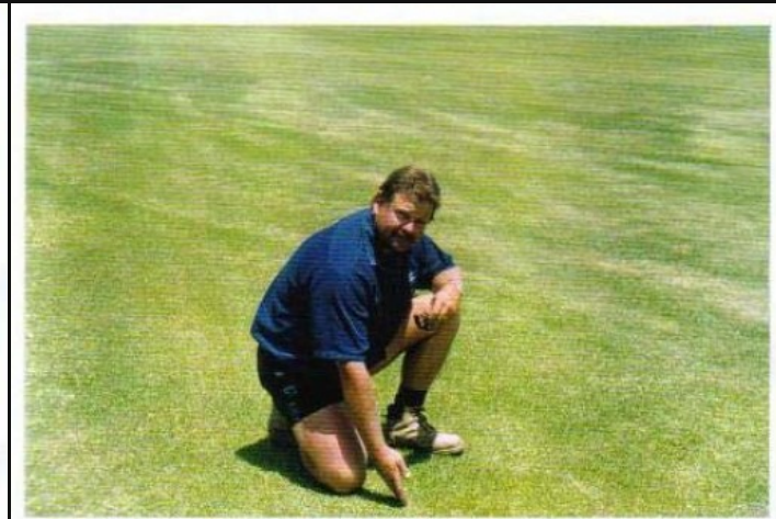
At Aquinas College the incorporation of Soil Zyme into the maintenance program has helped to present the turf on the College's main playing field in a uniformly green and vigorous sward.