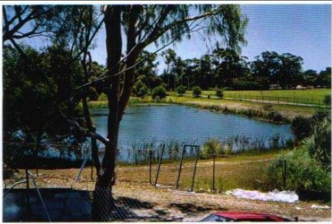
A five million litre lake at Hale School is used as an water storage from which all of the School's turf and gardens are irrigated. In October and January of each year, 75 litres of Soil Zyme is added to the lake so that all irrigated areas